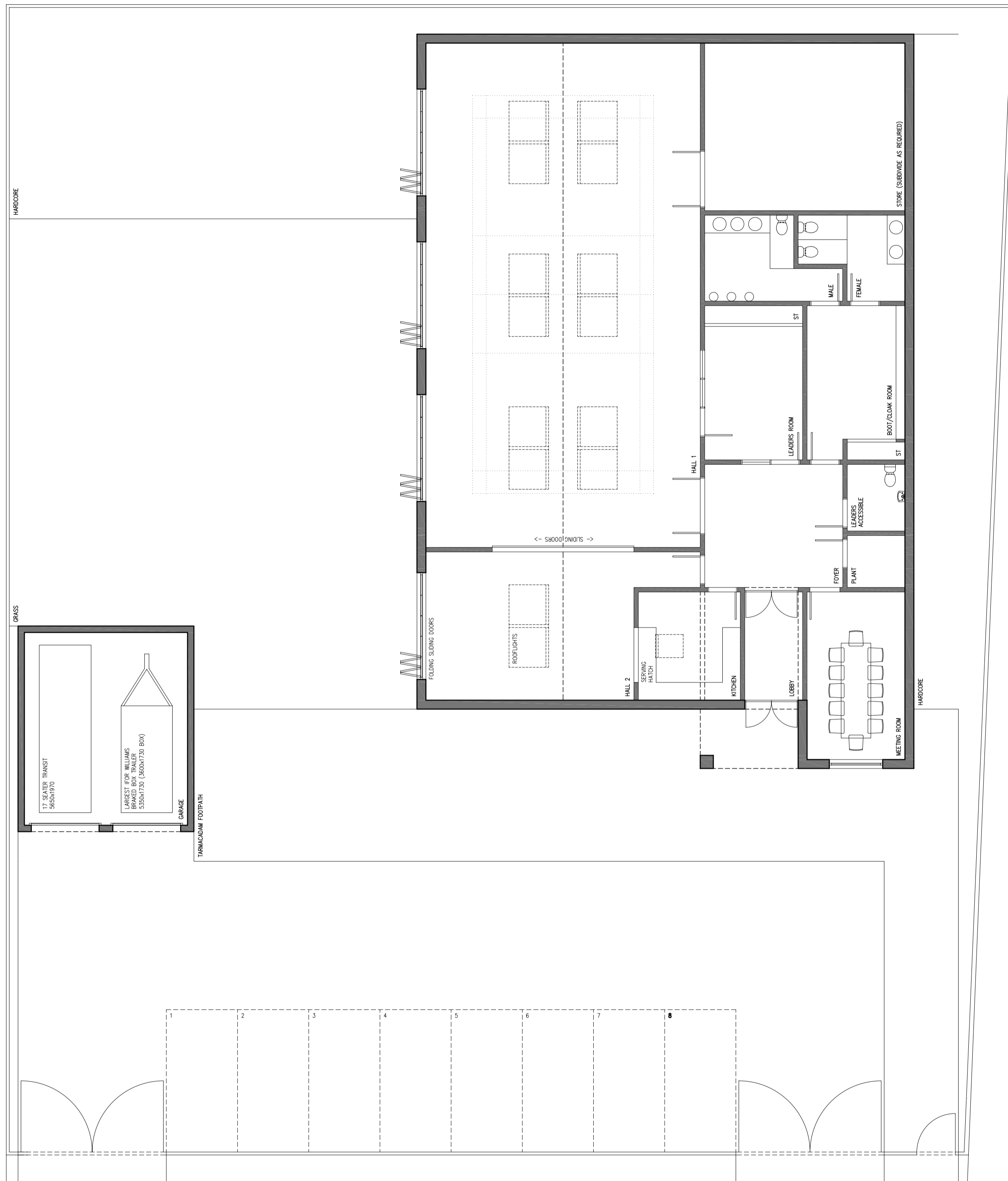
GROUND FLOOR PLAN @ 1:100